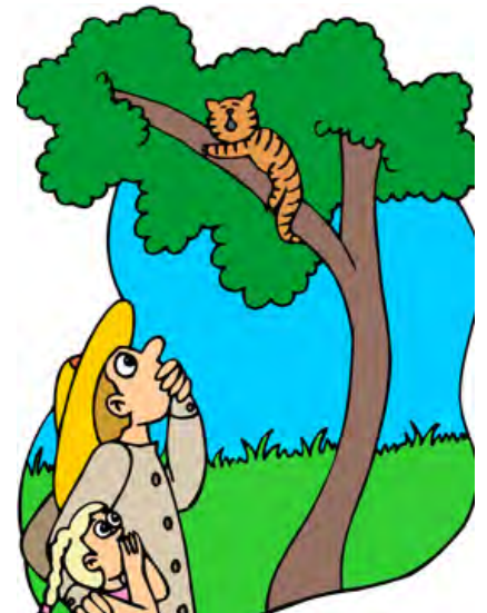
Katze / Baum