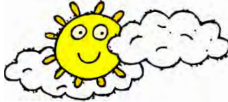
Sonne / Wolke