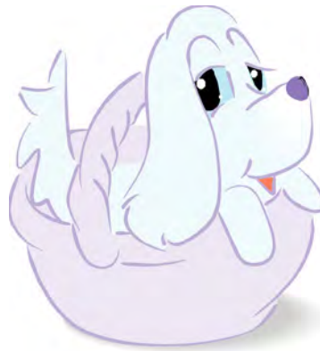
Hund / Korb